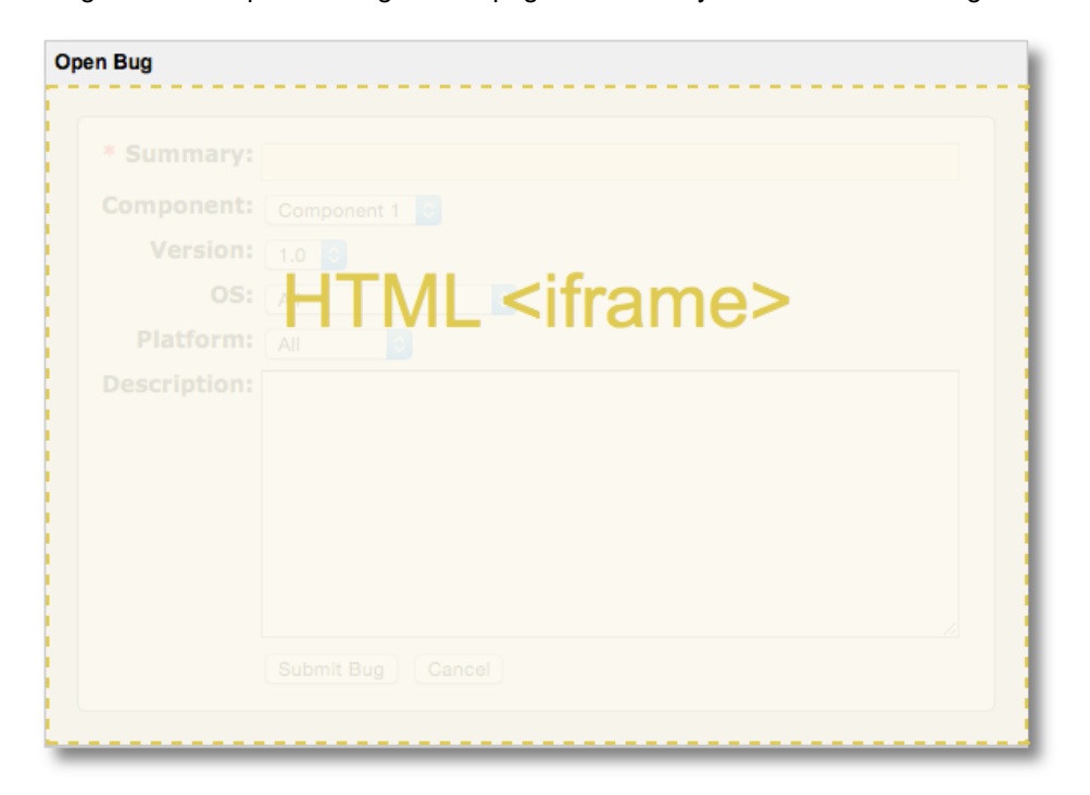
Fig. 2 Dialog iframe

Clients might choose to place dialogs inside page elements styled to look like a dialog window.