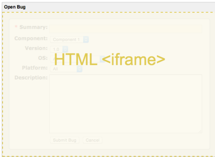
Fig. 2 Dialog iframe

Clients might choose to place dialogs inside page elements styled to look like a dialog window.